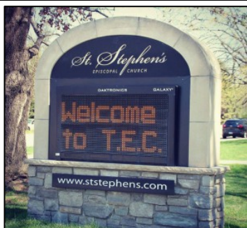
Teens Encounter Christ... and the Bishop.