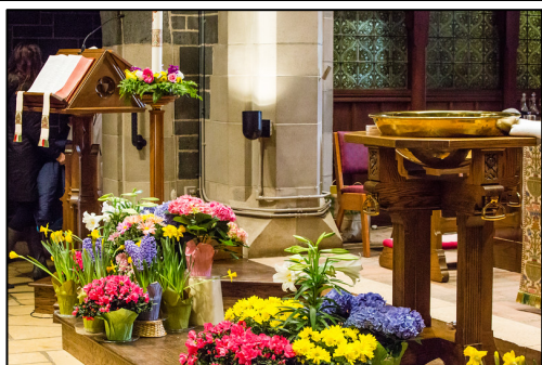
Easter April 1, 2018