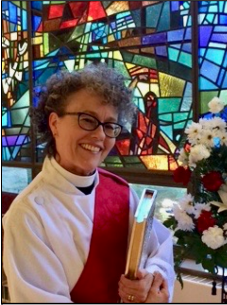
"I love being a Deacon."