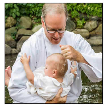
Baptisms in the creek.