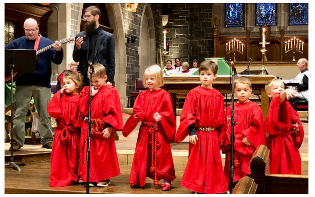
Hearing the Grace Notes Choir sing.