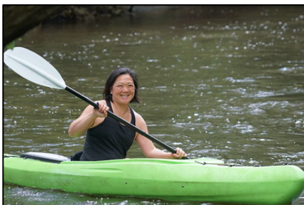
Enjoying Minnehaha Creek via kayak and canoe followed by a picnic.