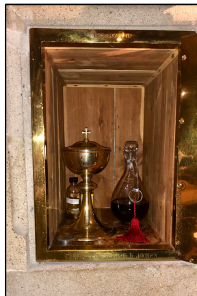
The aumbry (door open) showing the consecrated wine and wafers used for home communion.