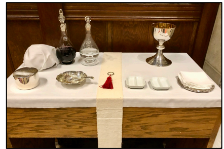
The altar guild sets up the credence table where the sacramental vessels are kept until carried to the altar for Holy Communion.

The members work in teams of three and work two weekend mornings every three months. They also make time for fellowship such as an English tea, a pool party and mini breakfasts before the quarterly meetings.