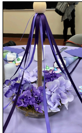
A May Pole was the centerpiece of each table.