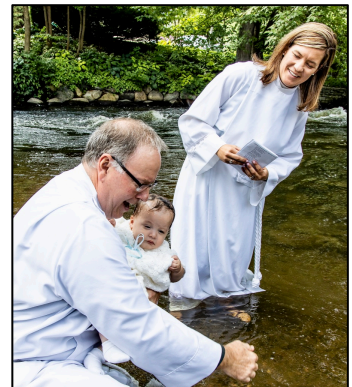
Baptism in the Creek