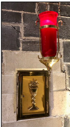
The Sanctuary Lamp and the aumbry (door closed) where the reserved sacrament is kept.