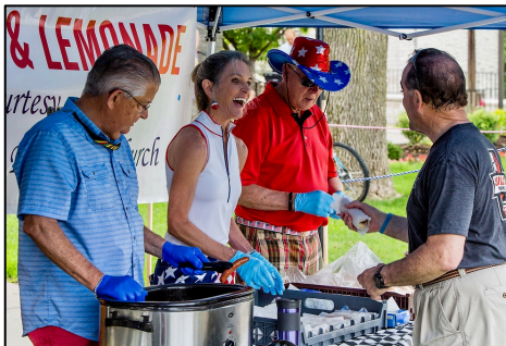
Hot dogs and lemonade while watching the City of Edina Fourth of July parade march by.

St. Stephen's Episcopal Church 4439 West 50 th Street Edina, MN 55424