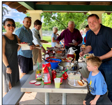
Pulled pork and sides at the 3rd annual St. Stephen's Family Picnic .