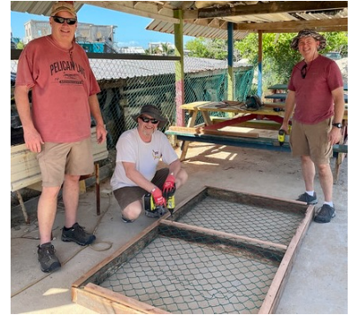
Building new security gates