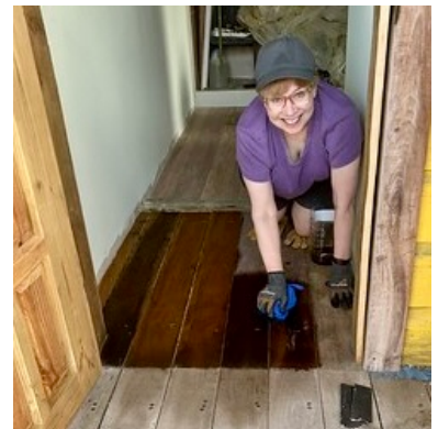
House of Grace — finishing floors.