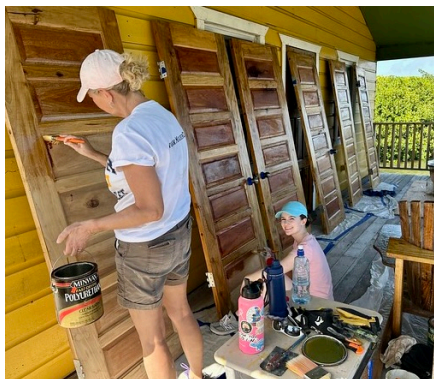
House of Grace —finishing doors.