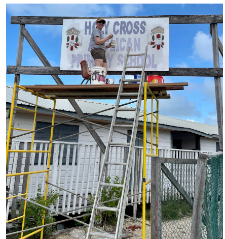
Re-painting the weather-beaten front sign.