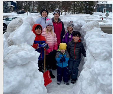
"Snow Day" Jan. 21 at St. Stephen's